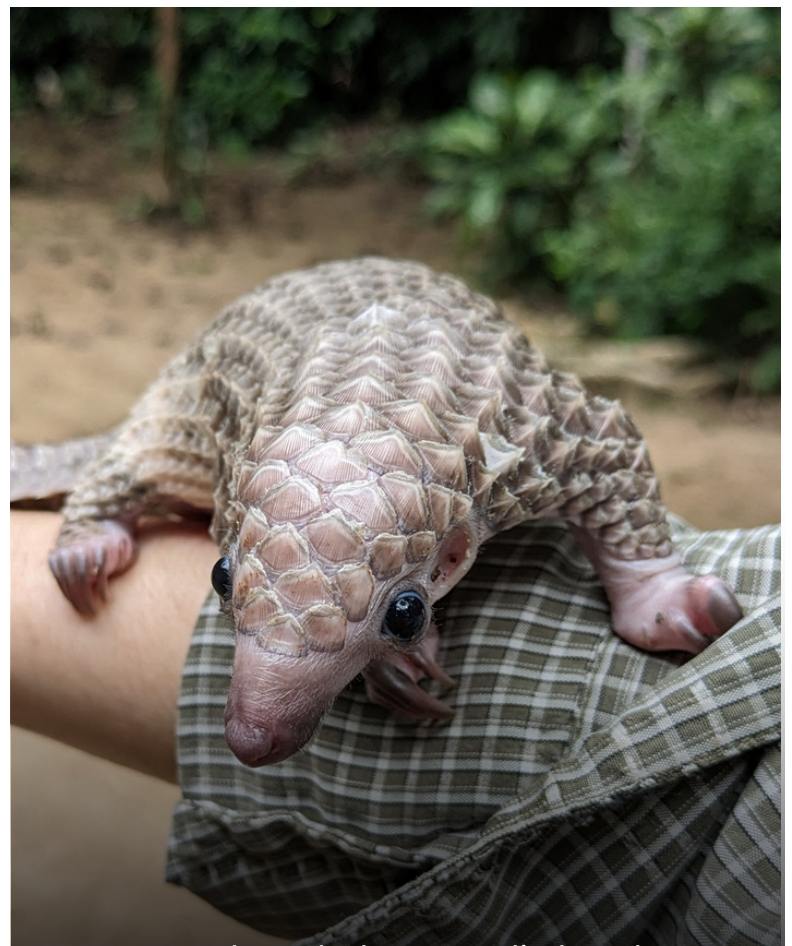
Meet Azamba, a baby pangolin hand-reared by Tikki Hywood Foundation.

Through the Forest Collective, camera trap footage of wildlife—like that of the black-bellied pangolin to the right—turns into funding that benefits the community.